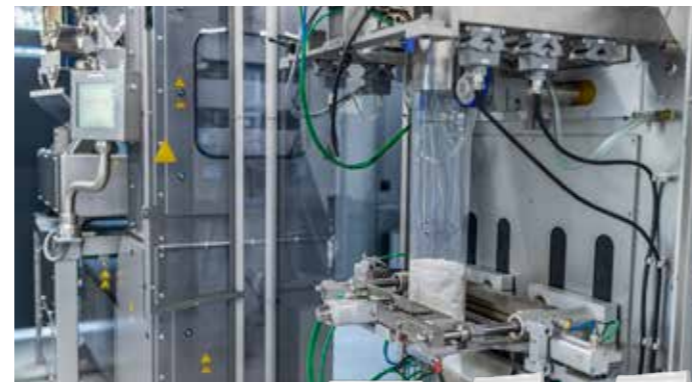
VERTICAL FLOW WRAP MACHINE