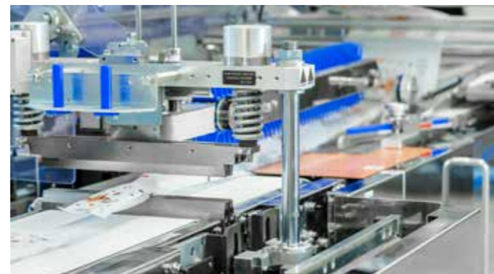
HORIZONTAL FLOW WRAP MACHINE