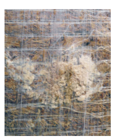
Mould is quickly identified with transparent film

Comments: *) SF = Standard film, **) TF = Transparent film; <sup>1</sup>) FM = Fresh mass, <sup>2</sup>) DM = Dry mass, <sup>3</sup>) KBE = Colony forming unit, NEL = Nett Energy Lactation